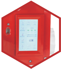
4.3寸触摸屏 4.3 inch touch panel