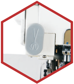
电动切线按钮 Manual trimmer button