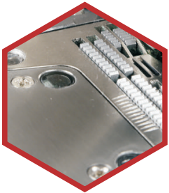
前后三光眼 Three sense